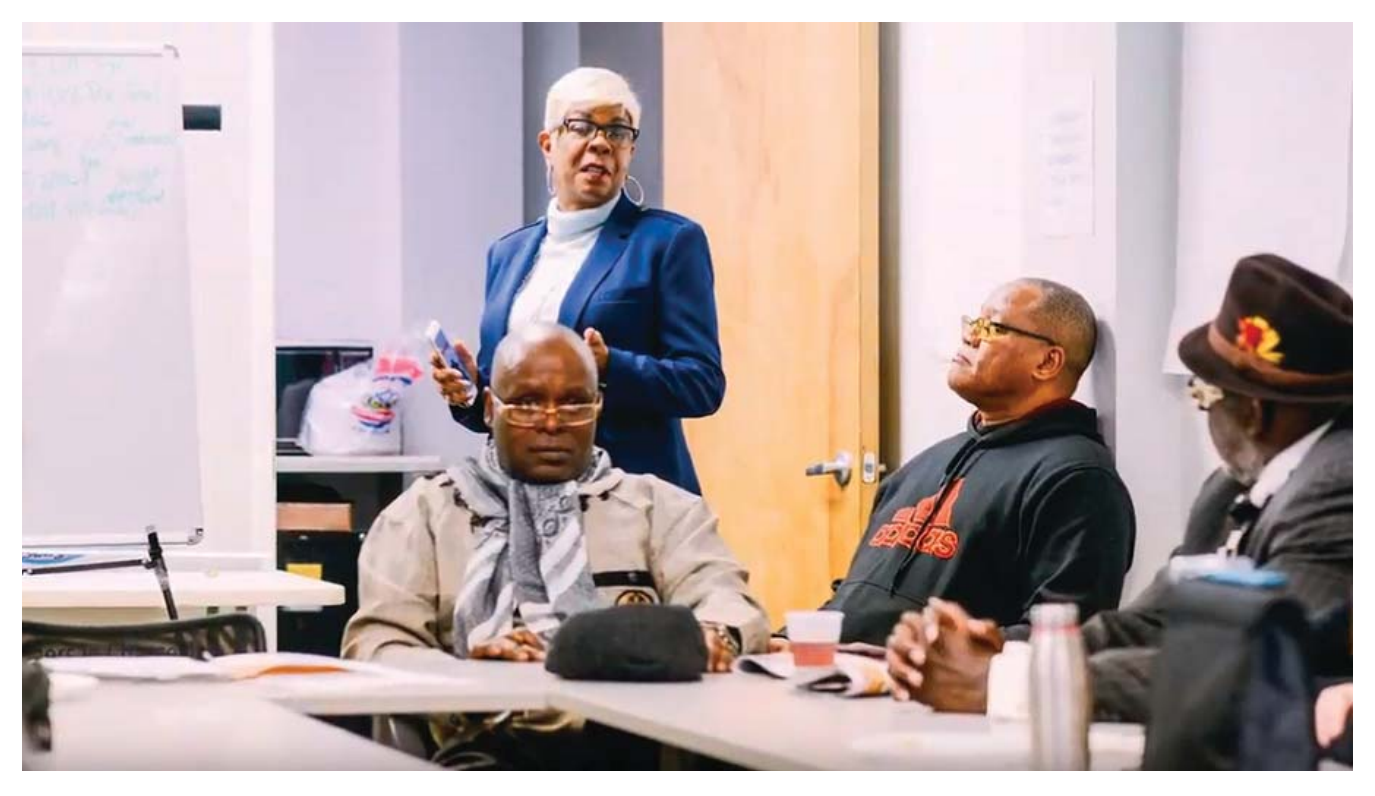
Screenshoot: Participatory Defense in Philadelphia video by Defender Association of Philadelphia

committed to ensuring that those who are involved in any aspect of the criminal justice system, are prepared to manage this situation as effectively and efficiently as possible. Given the trauma that an arrest causes to the accused, the family and community, the goals of the Participatory Defense program were a perfect fit for our agency."